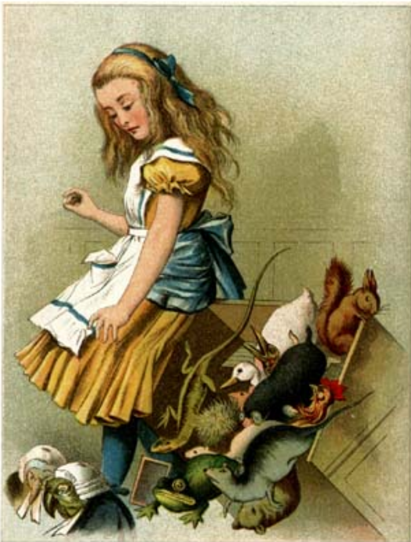
SHE TIPPED OVER THE JURY-BOX.

"Oh, please mind what you're doing!" cried Alice,