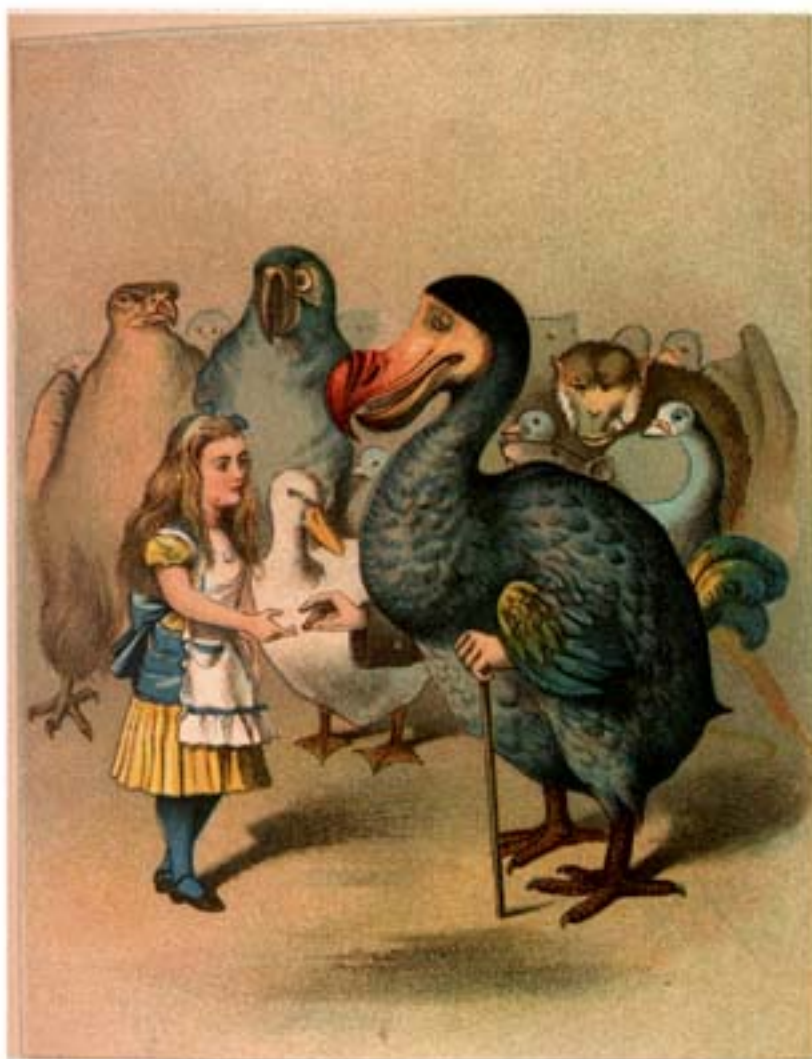
THE DODO SOLEMNLY PRESENTED THE THIMBLE.

There seemed to be no use in waiting by the little door, so she went back to the table, half hoping she might find another key on it, or at any rate a book of rules for shutting people up like telescopes: this time she found a little bottle on it, ("which certainly was not here before," said Alice,) and tied round the neck of the bottle was a paper label with the words