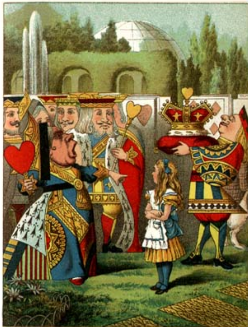
THE QUEEN SAID SEVERELY. "WHO IS THIS?"

"In my youth," said the sage, as he shook his grey locks, "I kept all my limbs very supple By the use of this ointment—one shilling a box— Allow me to sell you a couple."